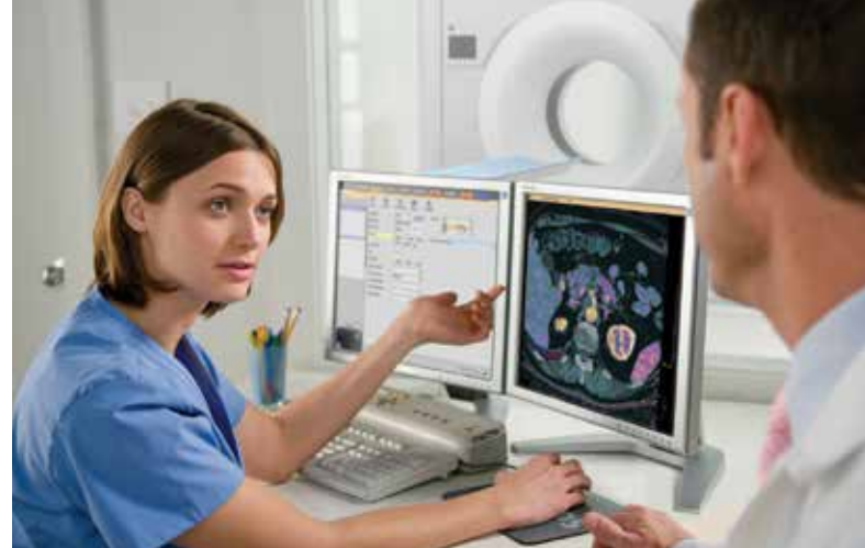
Results are ready to be read on the PACS.

Should the clinician decide that spectral information would be of additional value in a particular region of interest, the spectral information acquired during the single spectral scan can be easily accessed for retrospective, on-demand spectral data analysis.